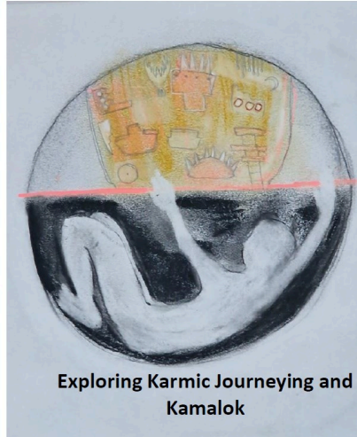
Exploring Karmic Journeying and Kamalok